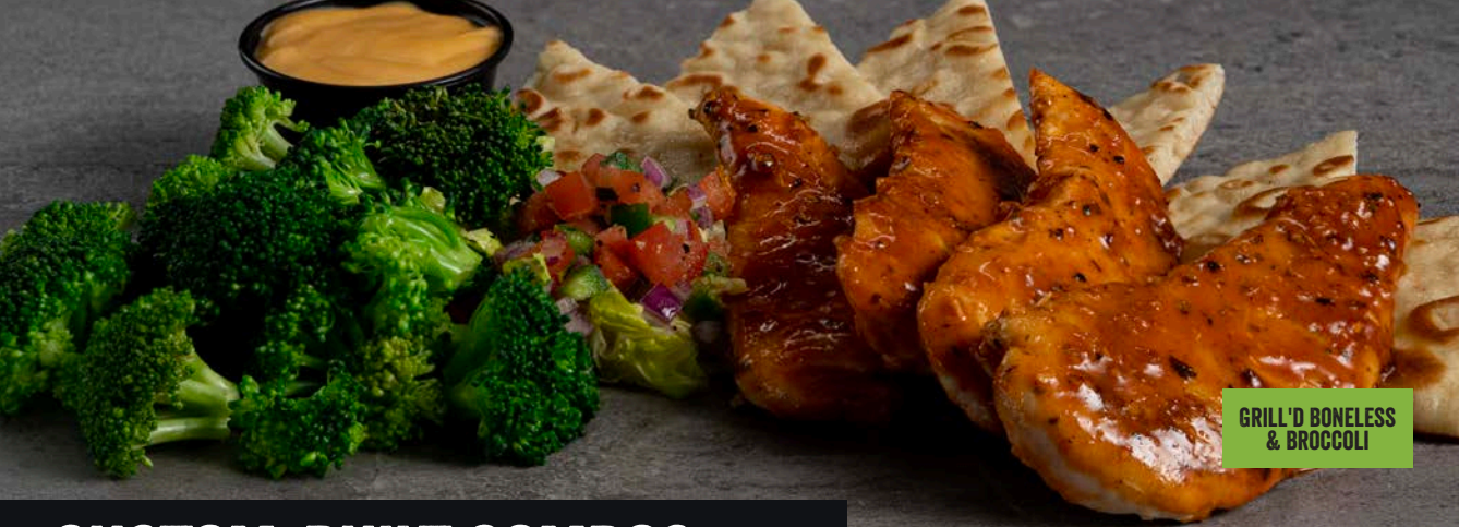
GRILL'D BONELESS & BROCCOLI