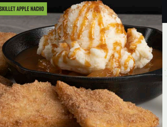
SKILLET APPLE NACHO

IT'S BACK! SKILLET APPLE NACHO Warm cinnamon apples in a sizzling skillet, topped with a giant scoop of Vanilla Bean ice cream & drizzled with caramel. Served with crispy fried cinnamon sugar pita crisps for dipping. 720 cal.