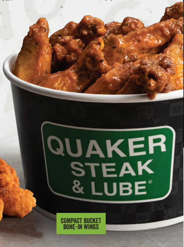
QUAKER STEAK & LUBE