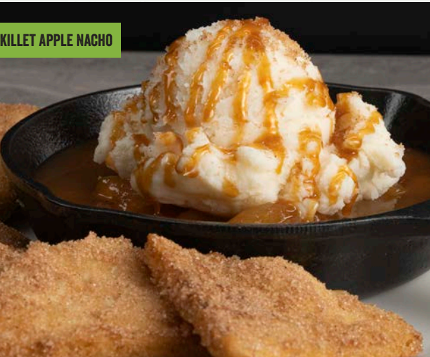
SKILLET APPLE NACHO