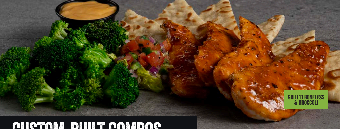
GRILL'D BONELESS & BROCCOLI