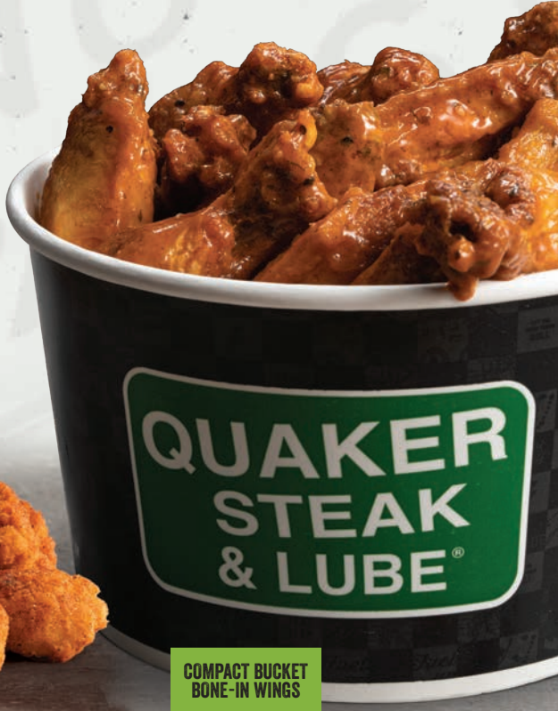
COMPACT BUCKET BONE-IN WINGS